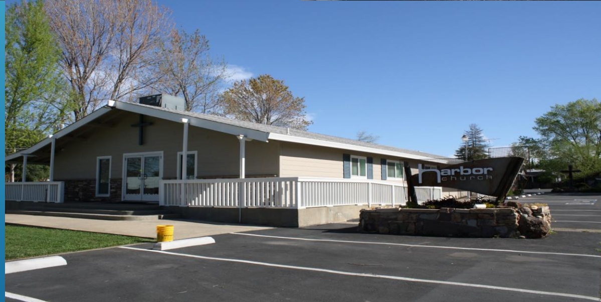
SHELTER SITES – MUSLIM COMMUNITY FOLSOM, MT OLIVE LUTHERAN CHURCH, HARBOR CHURCH